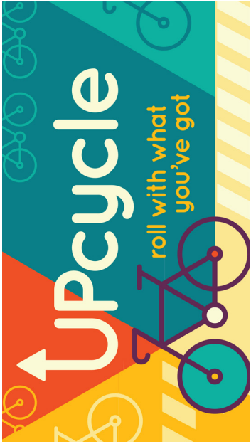
Theme - Upcycle