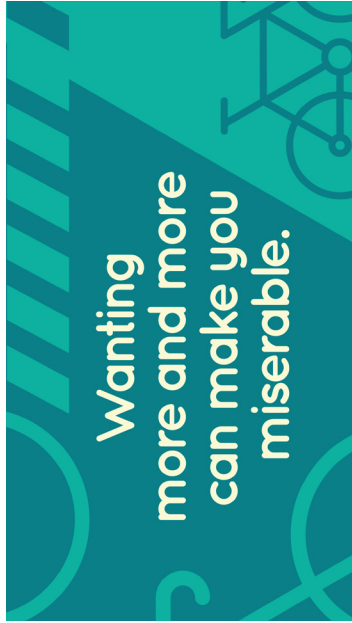
Bottom Line - Week 2