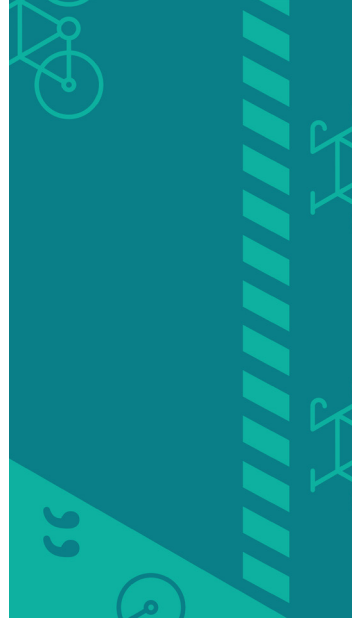
Memory Verse - Blank