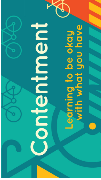
Life App - Contentment