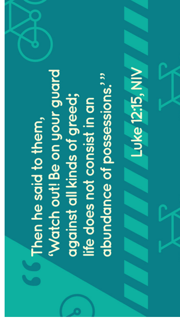
Memory Verse - NIV